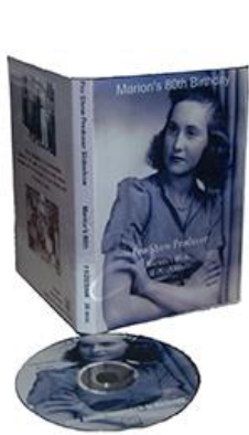
DVD Disc Will Match Case