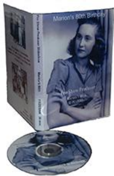
DVD Disc Will Match Case