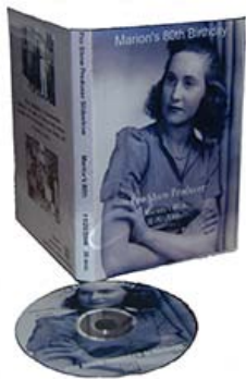
DVD Disc Will Match Case